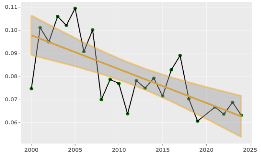
Share of Contributions Since 2000